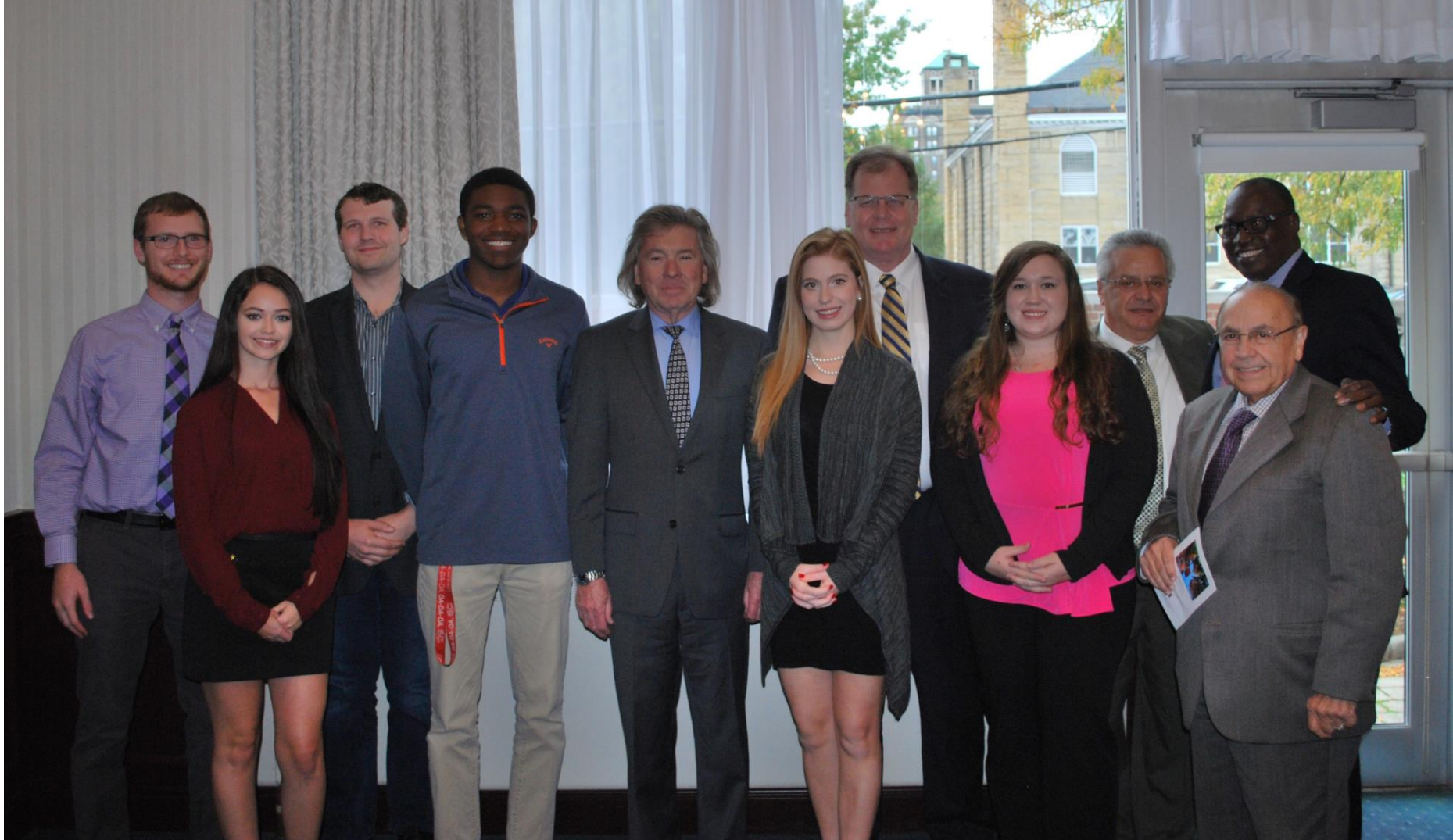
Pre-Law Society at Annual Luncheon